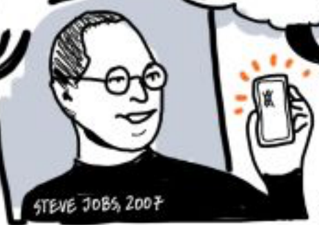
STEVE JOBS, 2007

YOU CAN'T PREDICT the future... YOU CAN ONLY DESCRIBE "the here and now" AND MAKE CONCLUSIONS & QUALIFIED GUESSES